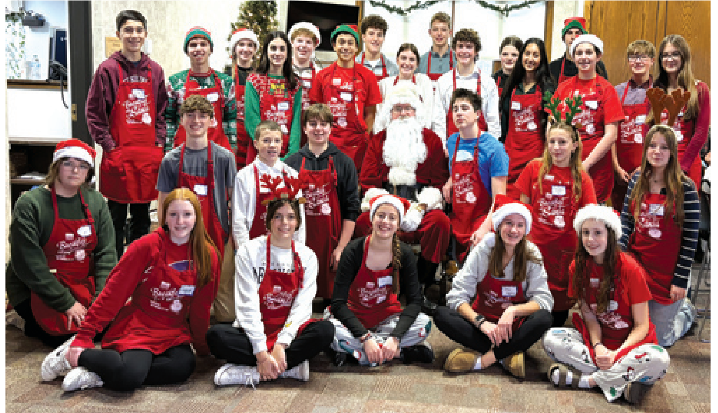
Santa and his elves, aka Confirmation students, pose during a break in the action at the Pancake Breakfast in Dwyer Hall, Dec. 7.

Our Confirmation students were excited to host the annual Pancake Breakfast with Santa, Dec. 7 in Dwyer Hall. They did a great job decorating, planning, and staffing the breakfast for our I.C. families!