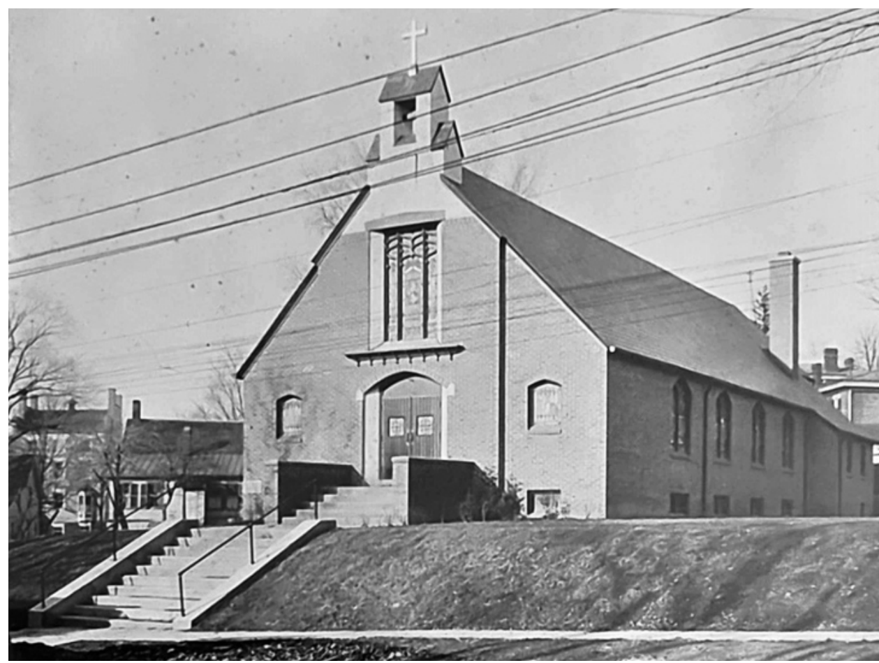
The original St. Ann's Church, circa 1949. This building is now St. Ann's Parish Center.