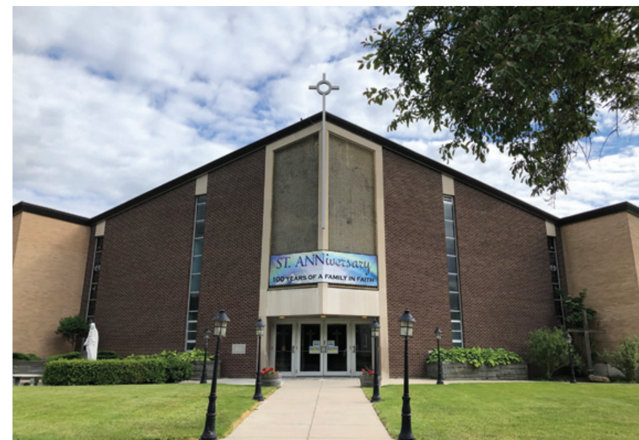
The current St. Ann's Church displaying the banner celebrating their 100th anniversary in 2020.